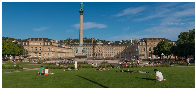
Schloßplatz in Stuttgart