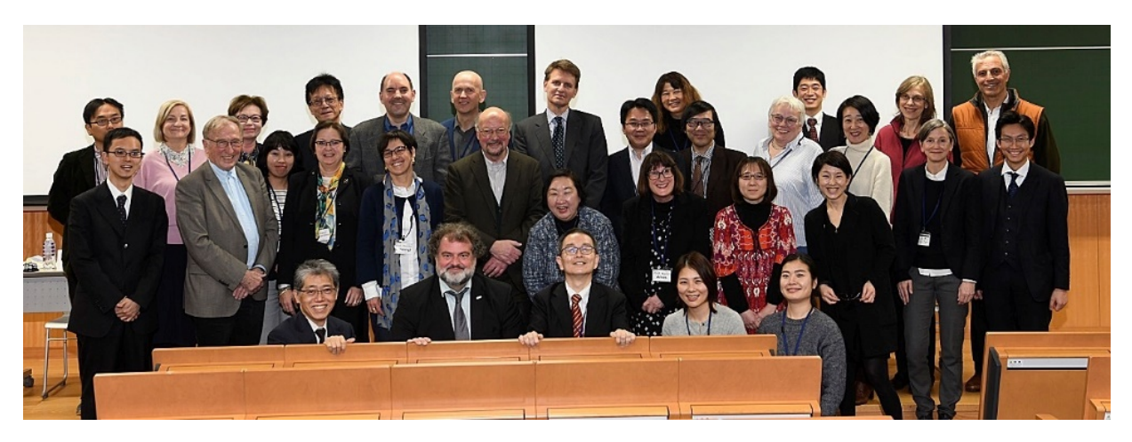
After the Panel Sessions at Ryōshinkan