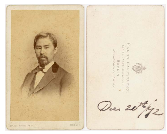
Photo portrait of Neesima taken in Germany in 1872