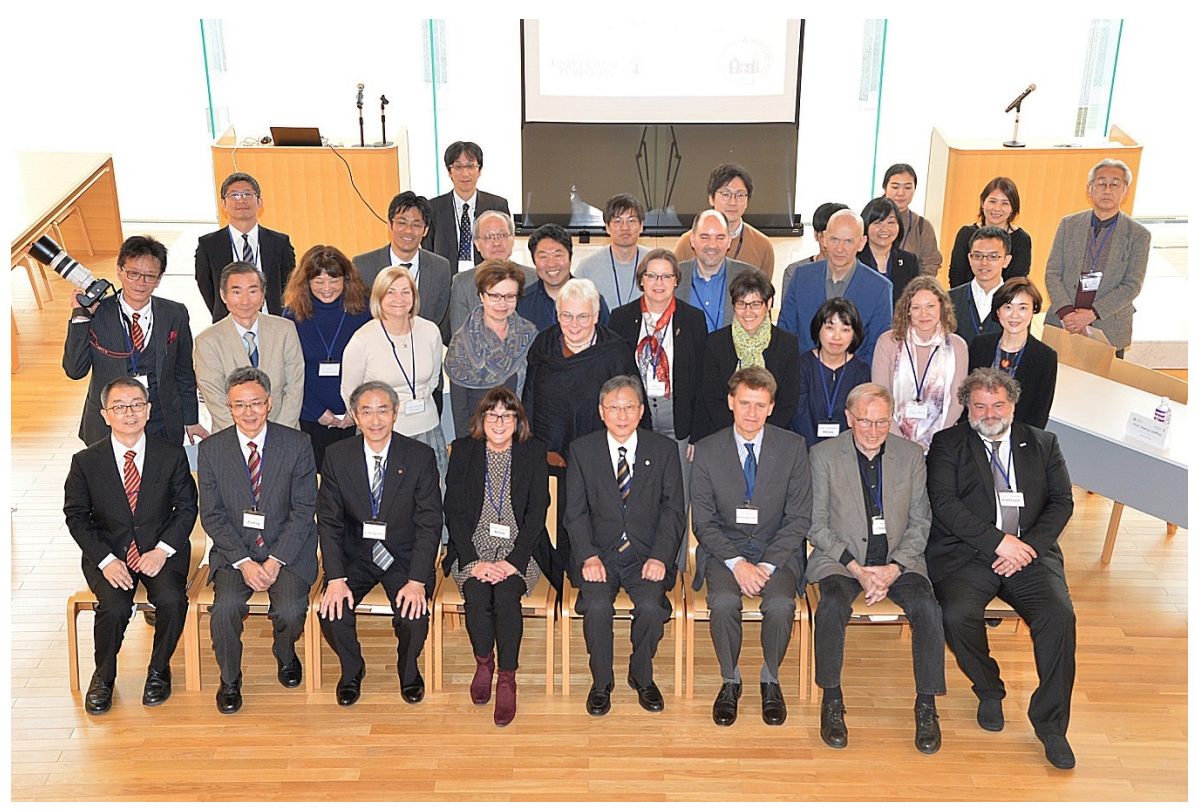
First day at Kotobakan Chapel, Kyōtanabe Campus

Under the general theme of 'Challenges toward Building Societies Filled with Respect for "Diversity", panel sessions with presentations on the following sub-themes were prepared: Diversity of physically and/or mentally challenged persons; Biodiversity; Diversity of gender/sexual orientations; Diversity of personal backgrounds and religions; Diversity of speech and thoughts. A lively discussion on those different subjects in English language followed between the scholars and researchers from Dōshisha University and the University of Tübingen.