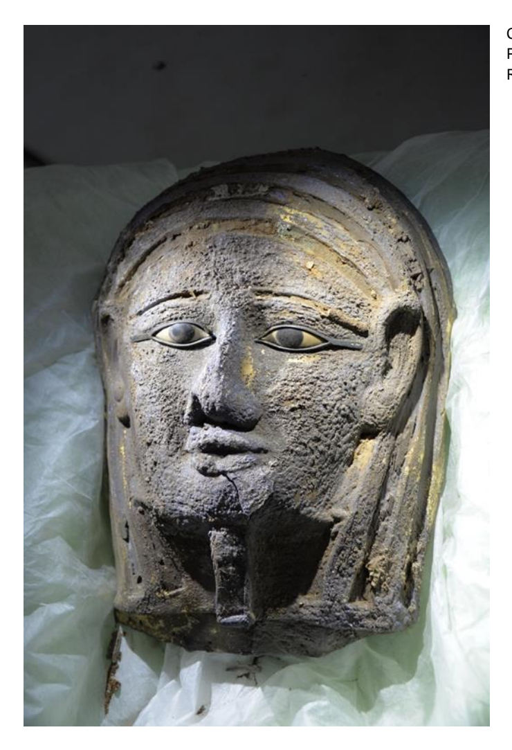
Caption: The Saqqara mask of the second priest of Mut and Priest of Niut-shaes.