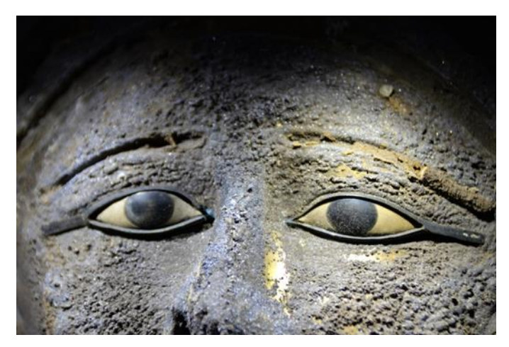
Caption: The Saqqara Mask of the Second Priest of Mut and Priest of Niut-shaes, details of eye inlay.