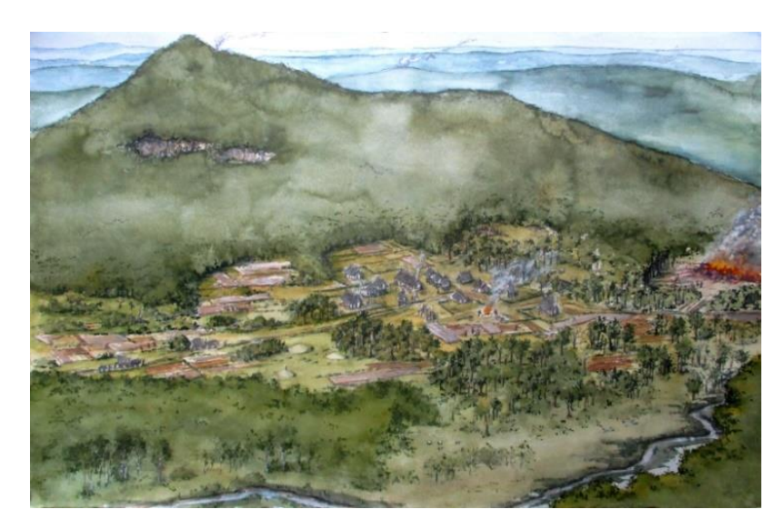
Artist's impression of a Bronze Age settlement in the Hegau region, where the living was easier than in the Western Allgäu. Image: Roland Gäfgen