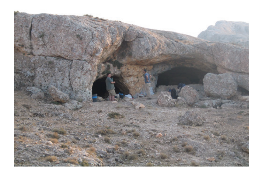
Photo 2. Kaus Kozah Cave. View of east (left) and west (right) entrances to cave with terrace in the foreground (1 October 2005).

While detailed analyses of the faunal and floral remains from Kaus Kozah are not yet available, some preliminary observations may be made on the artifact assemblages and their cultural stratigraphic context. The excavation currently extends to a depth of 70 cm below the surface, and we have thus far defined four stratigraphic units (Fig. 2). Following the conventions of the University of Tübingen the archaeological horizons (AH) are designated by Roman numerals that increase with depth.