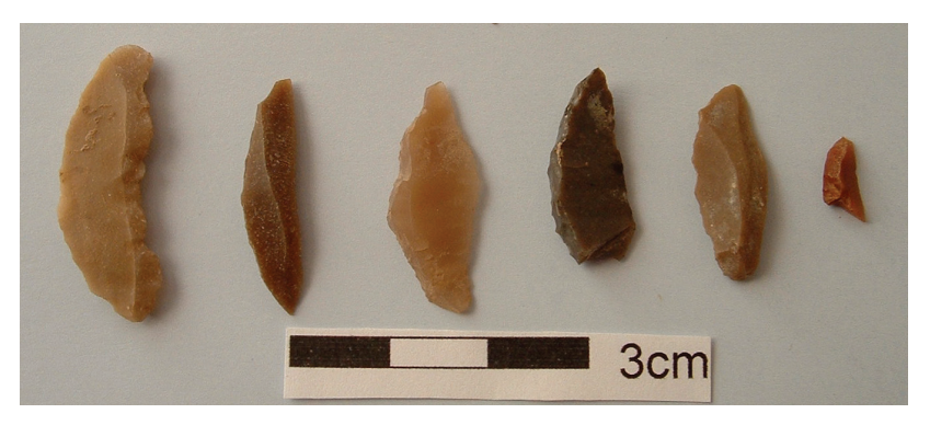
Photo 5. Kaus Kozah Cave. Lunates from surface, AH I and AH II.