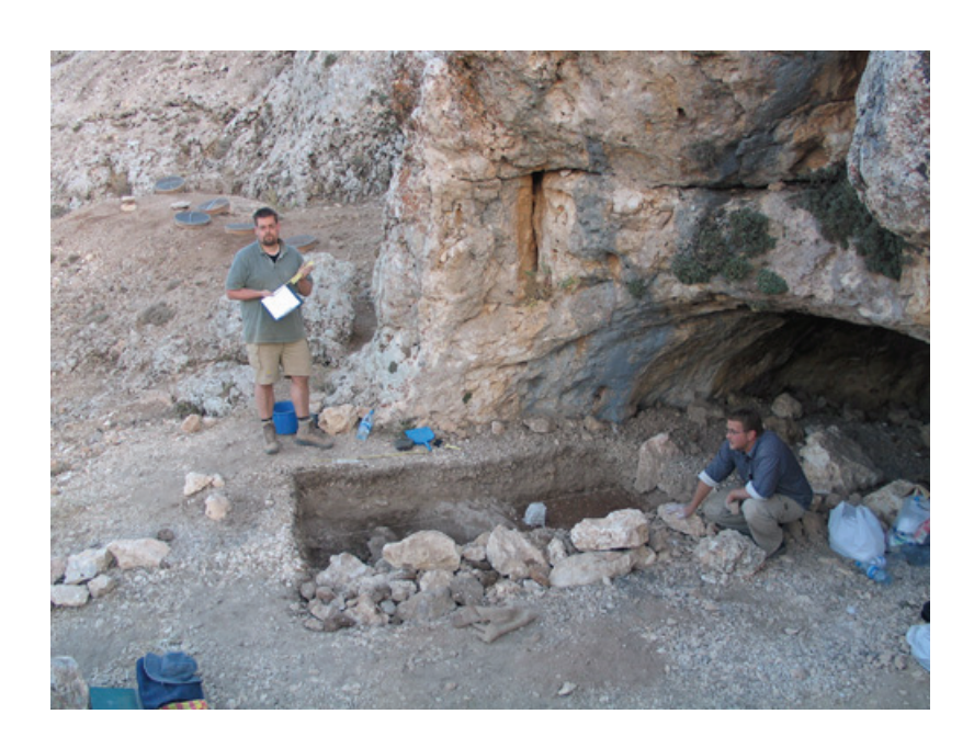
Photo 3. Kaus Kozah Cave. Overview of the 2005 excavation (7 October 2005).