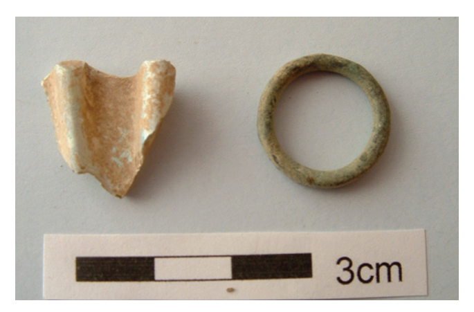
Photo 4. Kaus Kozah Cave. Turquoise colored glass and brass ring, both from AH III (Photo K. F. Hillgruber).

The earliest deposits at Kaus Kozah contain low densities of thin Levallois flakes with centripetal flaking scars on their dorsal surfaces and finely faceted striking platforms (Photo 8). In addition to the Levallois debitage, AH IV produced many juvenile human teeth and fragmentary postcranial bones that could be of particular interest, if they can be diagnosed as belonging to either modern or archaic humans. Initial results suggest that the human skeletal remains overlie the Levallois flakes in AH IV. The stratigraphic position of the human remains, nicknamed Charlotte, near the top of the Middle Paleolithic deposits could be of importance for reconstructing the human population dynamics during the late Middle Paleolithic and early Upper Paleolithic. Larger areas of excavation will be needed to characterize the assemblages from the deeper deposits at the site. In the 2005 season we were unable to reach bedrock in excavation unit 51/41, and it is often unclear whether or not exposed limestone surfaces in the northern two excavation units represent bedrock or the surfaces of boulders.