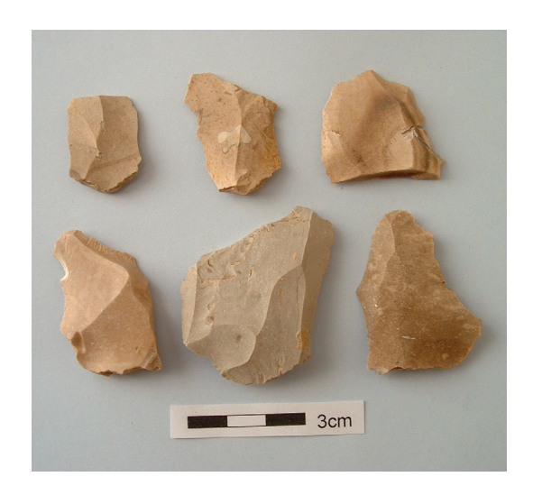
Photo 8. Kaus Kozah Cave. Levallois flakes with centripetal flaking scars from AH IV.