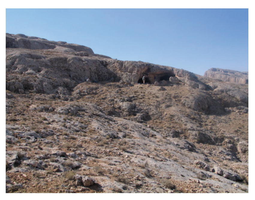
Photo 1. Kaus Kozah Cave. View looking south with Ma'aloula cliffline in background. (1 October 2005).

The team of the Tübinger Damaskus Ausgrabungs- und Survey Projekt (TDASP) identified Kaus Kozah Cave during the 2000 season. The cave formed in the Oligocene cuesta just north of the Ma'aloula canyon. Large limestone boulders near the two entrances to the cave trapped sediments and contributed to the development of a terrace in front of the cave (Photo 1). Although the cave is very near the town of Ma'aloula, it is so discretely placed in the massive limestone cuesta that it is difficult to see. The interior of the cave has been badly damaged by unauthorized excavations, but due to the favorable setting, the terrace in front of the cave has not been subjected to major disturbances. The site is located at an elevation of 1490 meters above sea level and commands an outstanding view of the highland Ma'aloula Basin including the springs and a small lake that existed above the current canyon during the Late Pleistocene (Dodonov et al. in press). The view from the site extends to the peaks of the Anti-Lebanon Mountains to the west, and from atop the nearby Oligocene cliff, the view extends over the lowlands to the east for many kilometers.