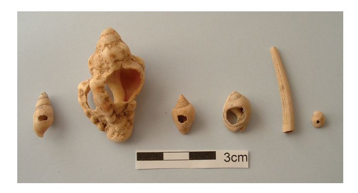
Photo 7. Kaus Kozah Cave. Ornamental shells from AH I and AH II. From left to right: Two as yet unidentified species of marine gastropods, Columbella rustica, Arcularia gibbulosa, Dentalium sp. and Theodoxus jordani.