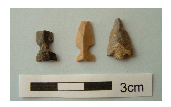
Photo 6. Photo 6. Kaus Kozah Cave. Two Khiam points (left) and Neolithic arrowhead (right) from AH I and AH III.