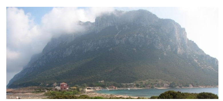
The island Tavolara