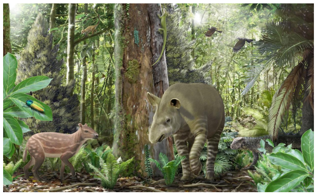
Window into the 47 million year old ecosystem of the Geiseltal fossil locality with the small-sized horse-ancestor Propalaeotherium on the left, the ancient tapir Lophiodon in the middle, and a young terrestrial crocodile Bergisuchus in the background.