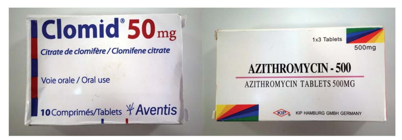
Fig 2. Examples of falsified medicines identified in this study. Left: Falsified Clomid tablets. Note the misspelling "Citrate de clomifère" instead of "Citrate de clomifène". Right: Falsified Azithromycin tablets. The indicated manufacturer "KIP Hamburg GmbH Germany" does not exist. Further details of these two falsified medicines are given in Table 4 (samples no. 14 and 21).

https://doi.org/10.1371/journal.pone.0184165.g002