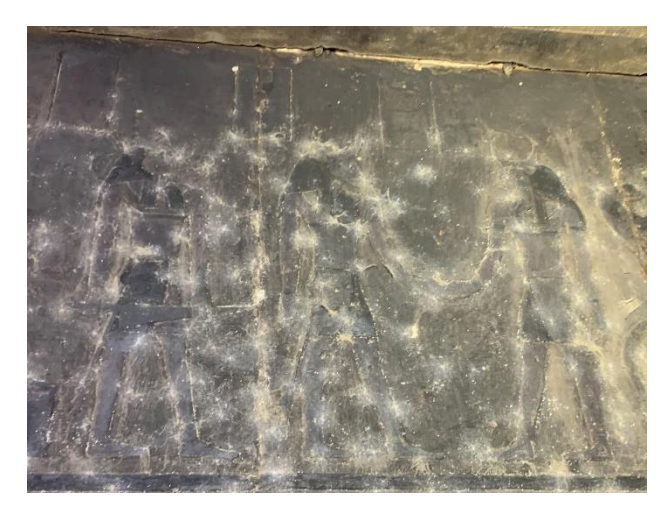
Two of the "seven arrows," pre-restoration