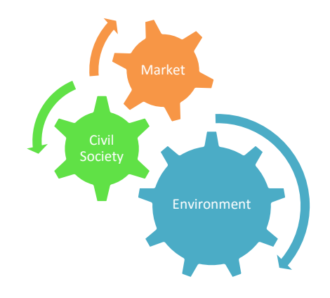
Figure 1. AFN as civil society adjusting the dynamics between market and environment

justice alongside economic profit making (Guthman, 2007) °.