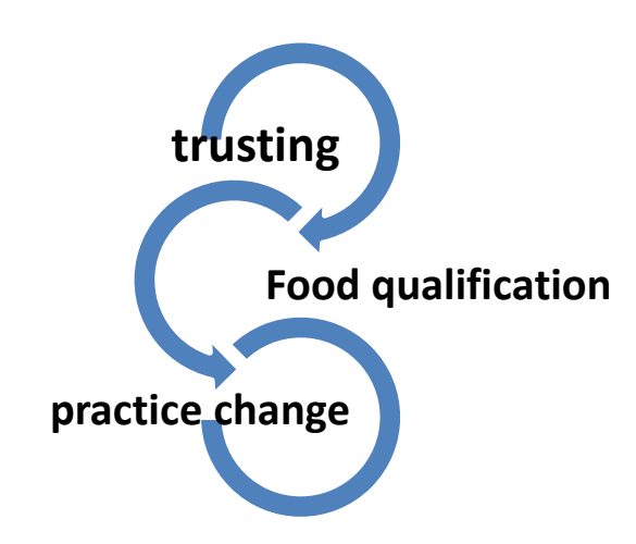
Figure 3. Dynamics of socioeconomic processes in AFNs

Figure 3 below shows the trust between actors is important for the qualification of foods while understanding food qualities in new ways may require changes in consumption practices. At the same time, consumer practice change may shape trusting relationships with farmers. In other words, there can be a dynamic between the relations between actors and the valuation and use of foods. This is a dynamics that the Polanyian concept of instituted economic process enables us to recognize and analyze.