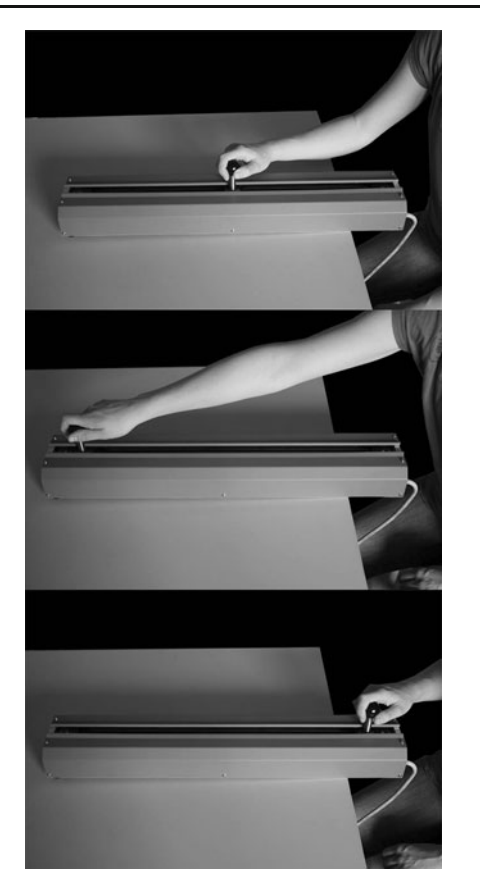
Fig. 1 Response device used for Experiments 1 and 2

well as the movement time (MT) required from response onset to one of the two endpoints.