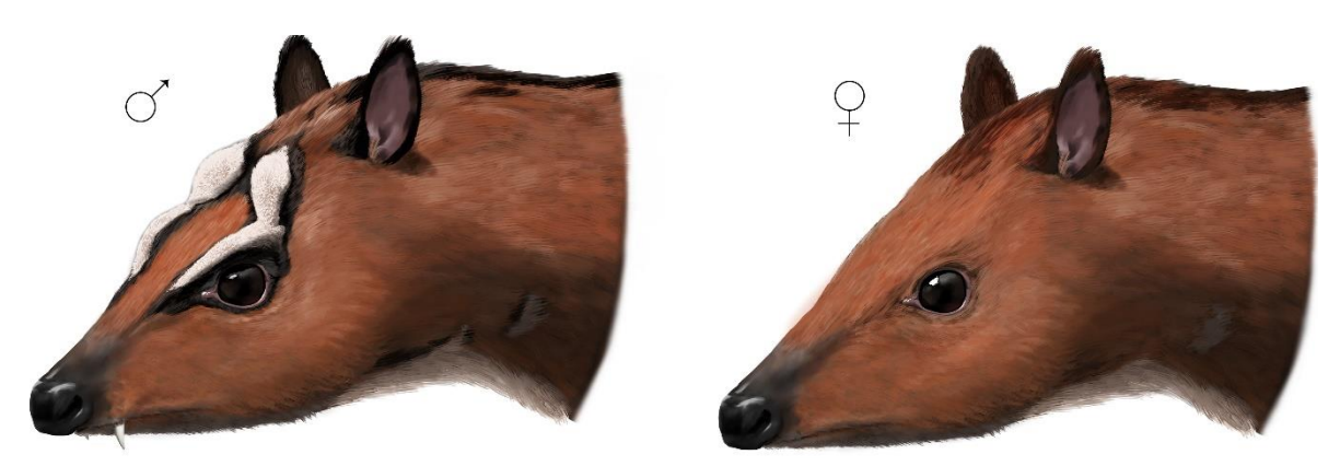
Drawing of the male (left) and female mouse deer of the species Dorcatherium naui , which lived eleven million years ago in what is now Germany's Allgäu region. Drawings: © Peter Nicklolaus

"Once again, the excavations at Hammerschmiede have shown the unique potential of the fossils. They help us to learn more about the evolution and biology of extinct species," says Böhme.