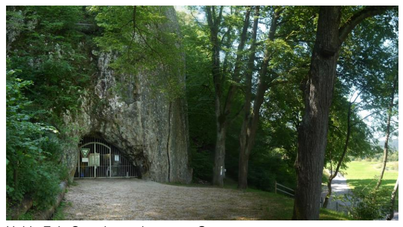
Hohle Fels Cave in southwestern Germany