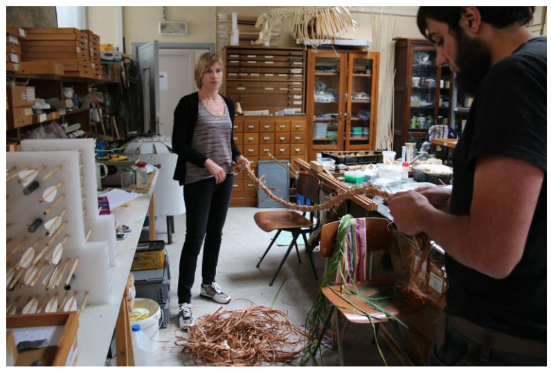
Researchers at the University of Liège making rope using Ice Age Technology