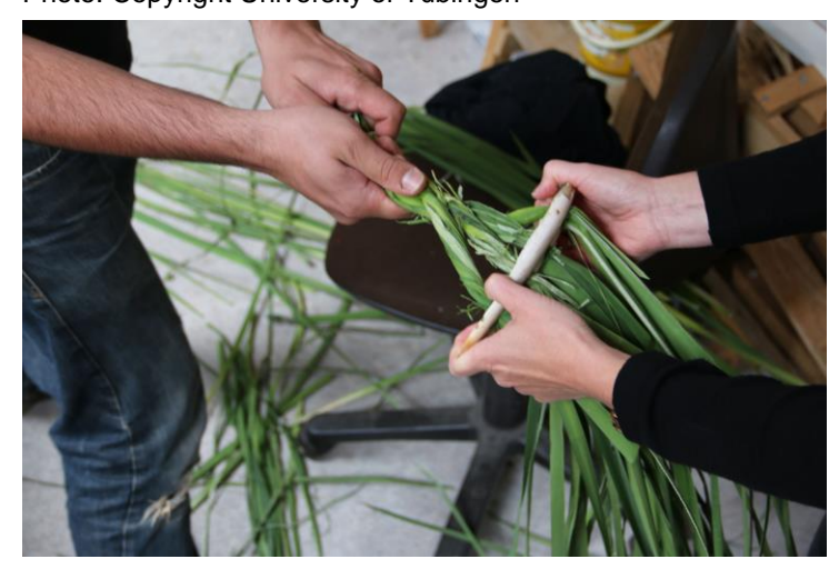
Experiments demonstrating how the ivory artifact was used to make rope