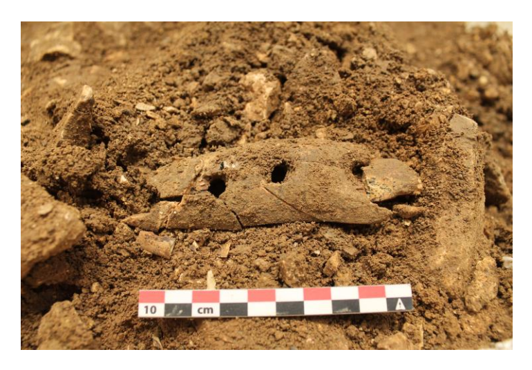
The context of the rope-making tool at the time of discovery in August 2015