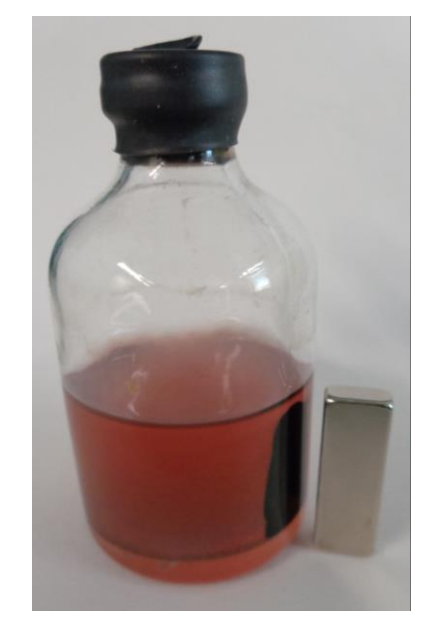
The phototrophic Fe(II)-oxidizing bacterium Rhodopseudomonas palustris TIE-1 with magnetite nanoparticles (sticking to a magnet at the right side of the bottle);photo taken by Dr. James Byrne