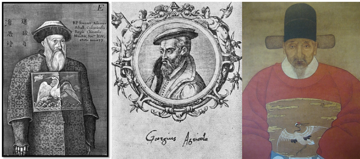
Three important historical actors discussed in this project, from left to right Johann Adam Schall von Bell, Georgius Agricola and Xu Guangqi.