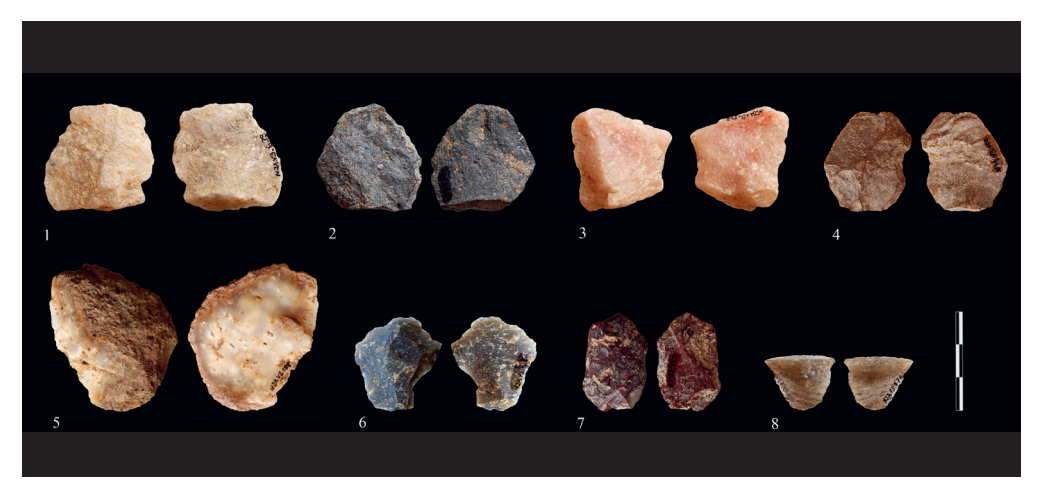
Fig. 4: Selection of different raw materials from layer III and V at Njarasa. 1) Quartz, 2) Basalt, 3) Rose quartz, 4–8) different variations of chert to be further investigated.

At the current stage, the lithic analysis of layer V and III is still in progress, but some preliminary findings are presented here. In both assemblages, most artifacts are made of hydrothermal quartz (Fig. 4.1), which is available in large quantities directly at the site in the form of large angular blocks. This raw material is also the most abundant lithic material at Mumba. Apart from this rock type we observed a large variability in different cherts (Fig. 4.4–8) and very few pieces of obsidian. Among the cherts are metasomatic sedimentary cherts from the Great Rift lakes and hydrothermal cherts formed in volcanic suites which are suitable for provenience tracing. The potential implications for our understanding of long-distance movements and territorial effects in the MSA and LSA of East Africa are obvious.