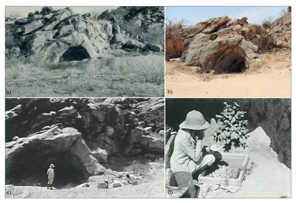
Fig. 2: a) Njarasa Cave with backdirt in front of the site 1935; modified after Kohl-Larsen (1943),

technology, use wear analysis, petrography and zooarchaeology. We plan to publish our results in English and in international open access scientific journals. This project will take place in collaboration with students and researchers from Germany and Tanzania. As a first step, we started by assessing the size, integrity and research potential of the archaeological samples from different sites excavated by the Kohl-Larsens and curated them at the University of Tübingen. As many of the assemblages were recovered from stratified MSA and LSA sites, the collection offers large potential to improve the regional cultural and chronological framework in East Africa, where much archaeological information rests on unstratified open air sites (see Tryon and Faith 2013).