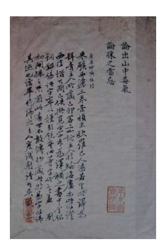
3: Taixi renshen shuogai , 1643 – End of the table of contents and beginning of the first chapter dealing with bones.

The Macau project will concentrate on the Taixi renshen shuogai 泰西人身說概 (An Outline of the Human Body from the Occident).