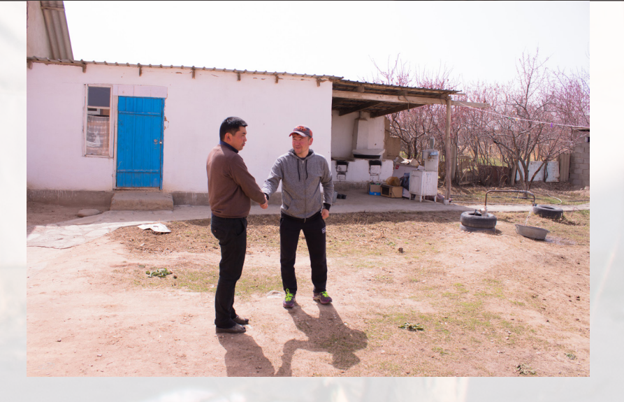
Respect towards older men and women is central.