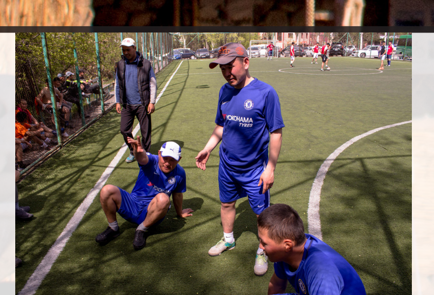
Football tournament of all male age groups.

My MA Thesis will be based on this data in order to look deeper into ideas of social adulthood, masculinity and morals. I want to explore the question of what it means to be a young man in contemporary rural Kyrgyzstan. My focus is to investigate these young men's aspirations, the ways of accomplishing them and the broader (and sometimes conflicting) moral frameworks these aspirations are based on.