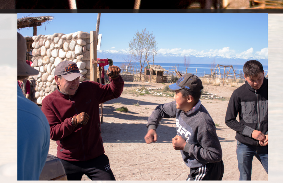
Playful fighting while doing collective cleaning.