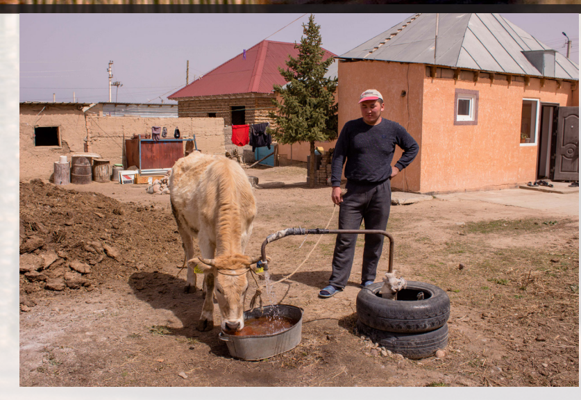
Feeding and taking care of the animals.