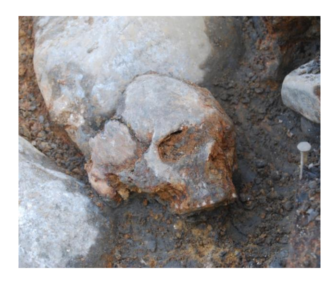
(D) The skull of Motala1, one of the seven approximately 8,000 year old Swedish hunter-gatherers sequenced in this study.