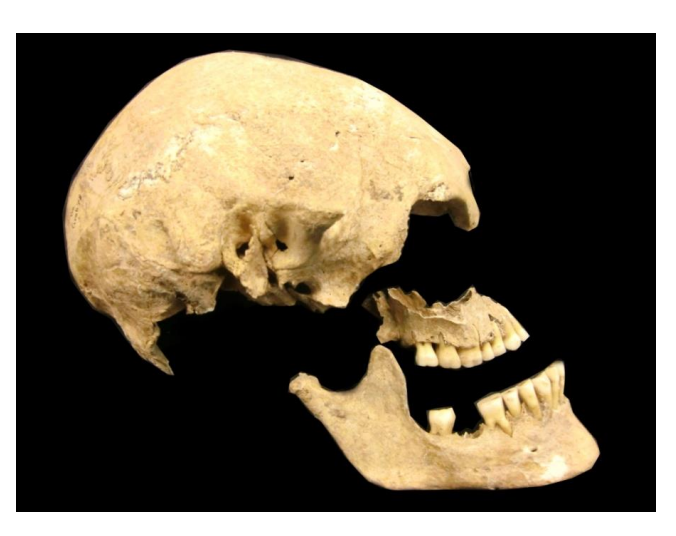
(B) Skull of the approximately 7,000 year old farmer females from Stuttgart in Germany, missing the lower right molar from which DNA was extracted.