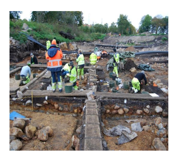
(C) Excavation at Kanaljorden in Motala, Sweden, the source of the seven approximately 8,000 year old hunter-gatherers sequenced in this study.