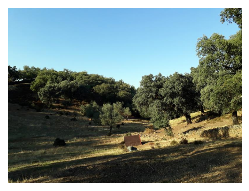
Dehesa landscape near Aracena in Sierra Morena.

Dierksmeier has found a clear connection between income and access to clean water. On the Canary Islands and the Balearic Islands, this led to social tensions, conflict and crime. Diseases broke out because there was not enough water for personal hygiene and to keep hospitals clean. Children and old people were worst affected. In an attempt to improve the situation, water was allocated to individuals on a quota system. This was meant to ensure that this scarce resource got to the people who needed it most. But it had the opposite effect: a general resource slowly became a commodity to be sold to the highest bidder. "Water police" were introduced to determine who owned the water, to check the water quality, and to punish those who polluted it. Academic societies such as the Sociedad de Amigos del País were formed to debate the best way to administer water resources, and to find ways of extracting fresh water from fog, snow, and sea water.