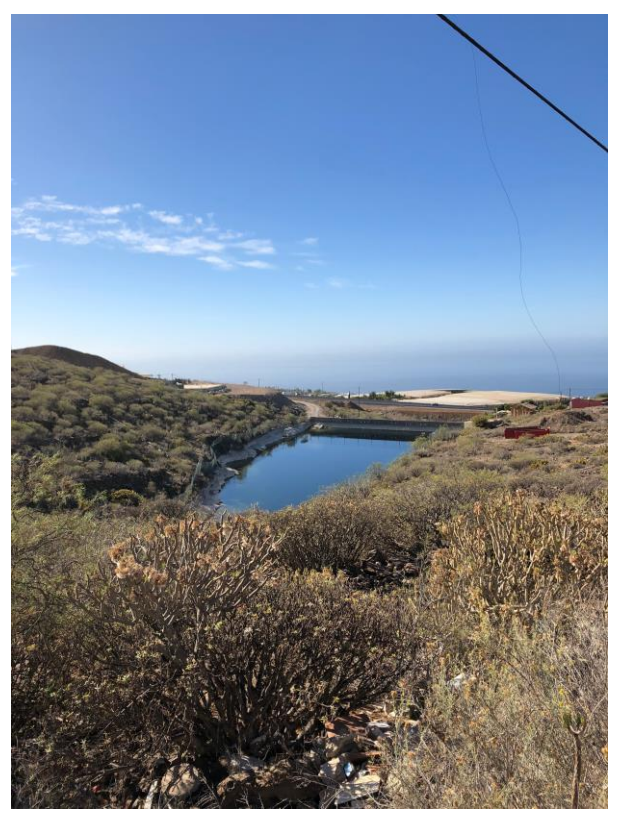
Rainwater storage for agriculture in the Canary Islands.