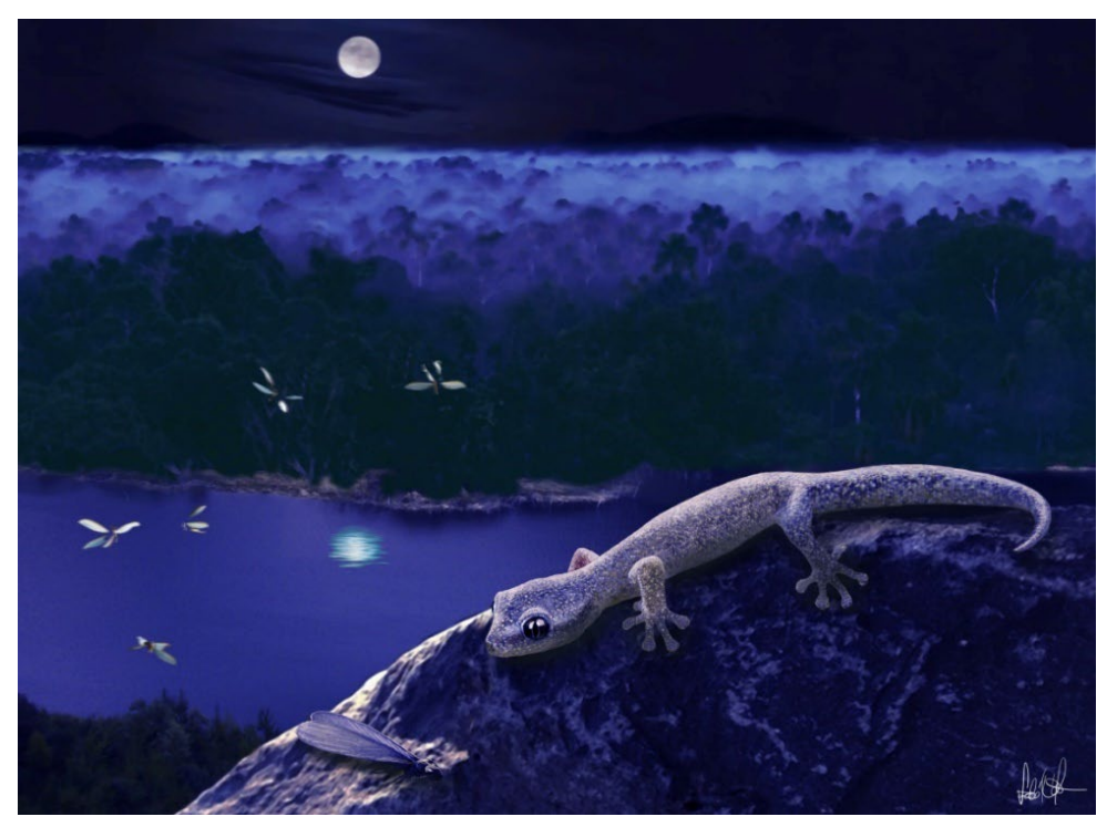
The Geiseltal valley about 47 million years ago - A gecko of the now extinct species Geiseleptes delfinoi hunting a male termite. Artist's impression: Márton Szabó