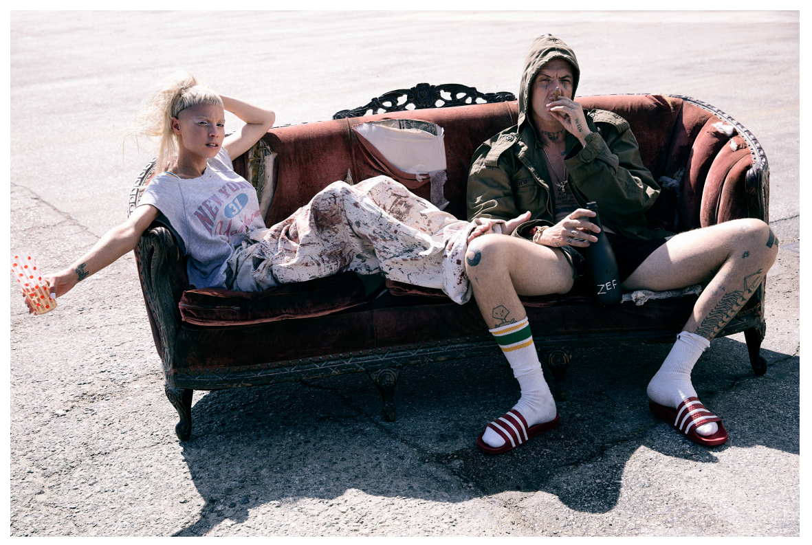
Zef is often refferred to as "Poor White Kitsch Chique"

The short film Zef side by Die Antwoord shows the inhabitants of the suburbs of cape town: toothless, drained looking women and men. Seemingly endless lines of the same looking houses decorate the streets. The patio where Yolanda and ninja perform is scattered with scrap metal, old buckets and empty alcohol bottles. Here, Die Antwoord uses a multiplication of clichés to portray the white working class. One must acknowledge, that they're not part of the social group (anymore), since they're making quite a lot of money with their music. The portrayal of the white lower class is of course exaggerated, which could be a way to further alienate whiteness in order to distance South Africa from its past. That transforms post apartheid identity "into an intertwined, multicultural nationalism, celebrating the hybridity of South African culture" (Chruszczewska, 2015: 64)