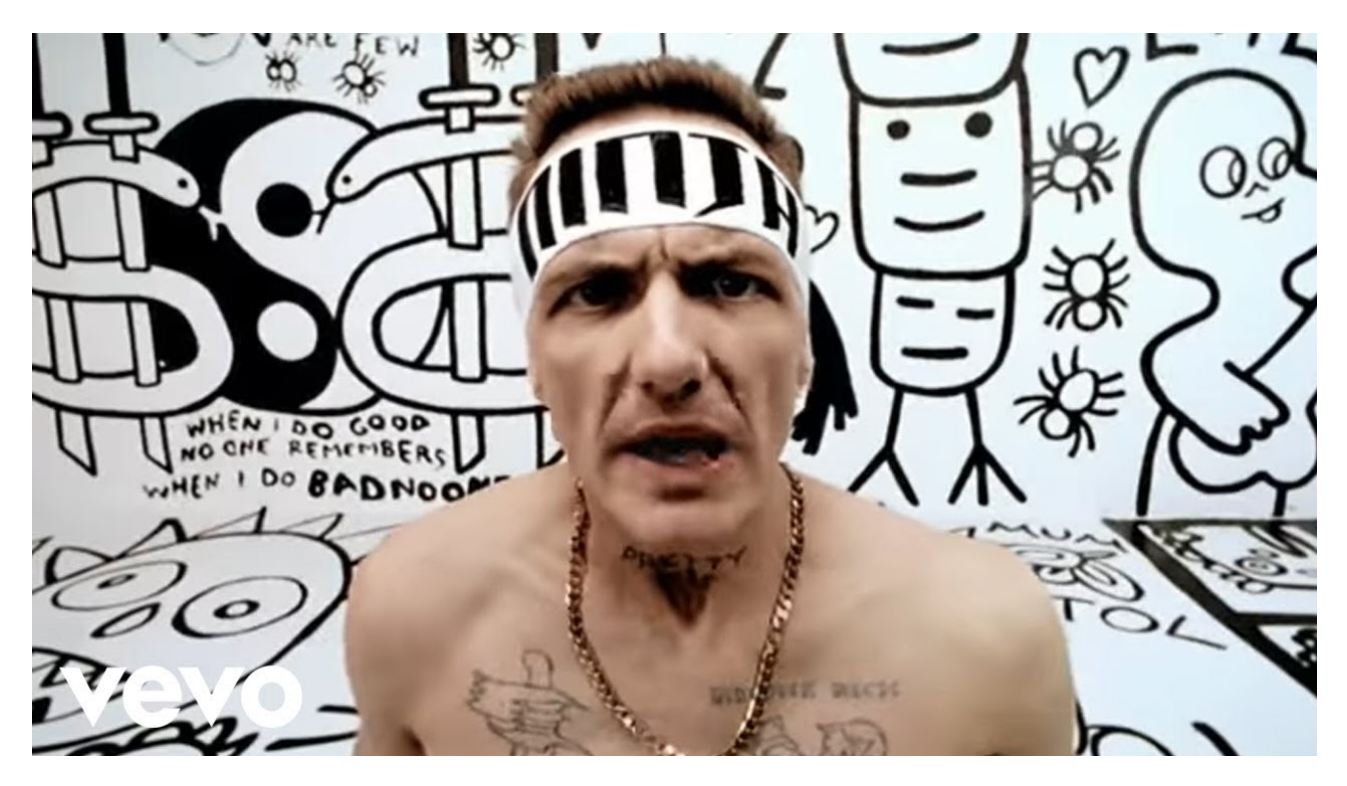
Enter the Ninja by Die Antwoord

"Hundred percent South African culture. In this place, you get a lot of different things. Blacks, whites, coloureds. English, Afrikaans, Xhosa, Zulu, watookal, whatever. I'm like all these different things, all these different people, fucked into one person."