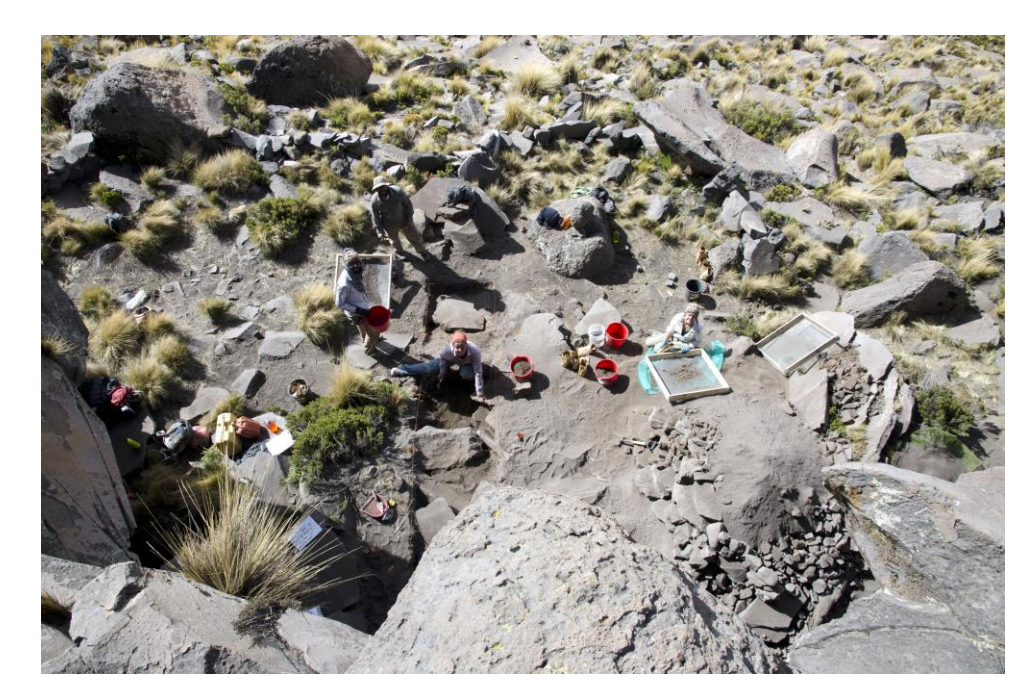
University of Tübingen excavation team in the Cuncaicha rockshelter of Peru.