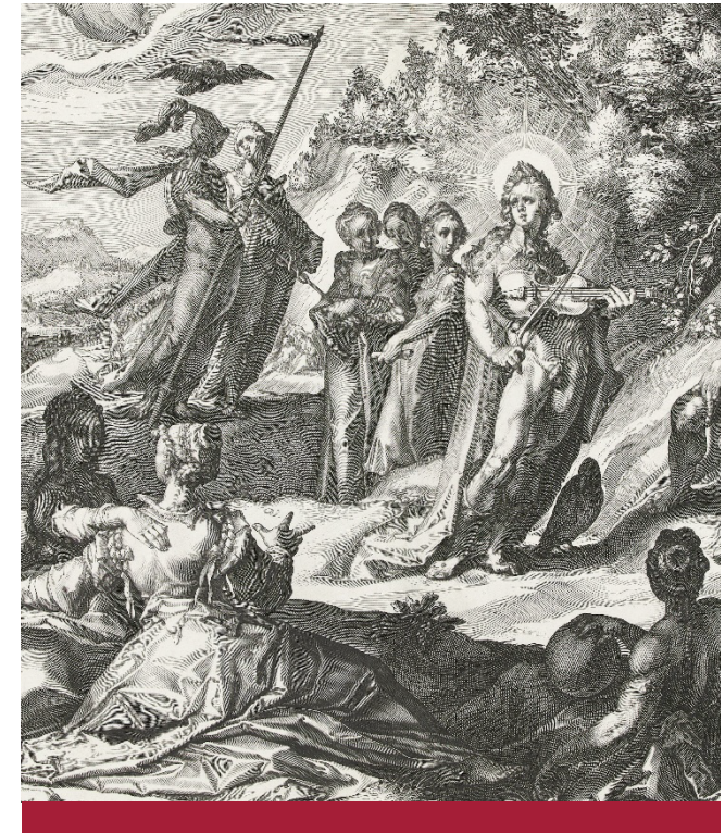
CRC 1391 Different Ästhetics