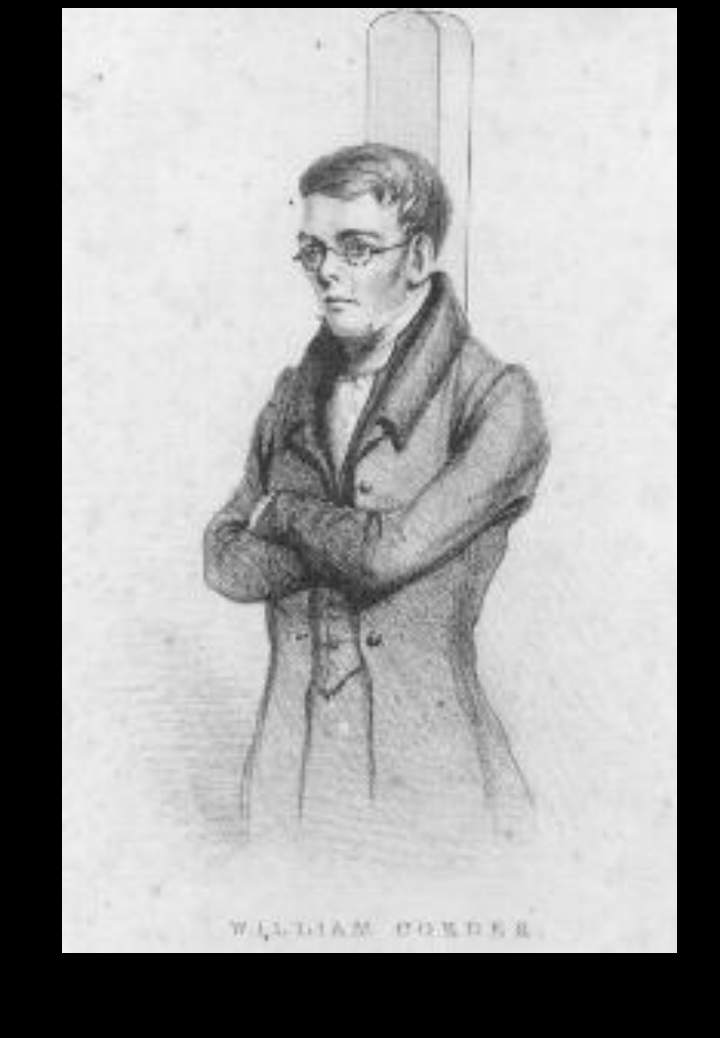
Come all you bold and thoughtless men And a warning take by me To think of my unhappy fate To be hanged upon a tree