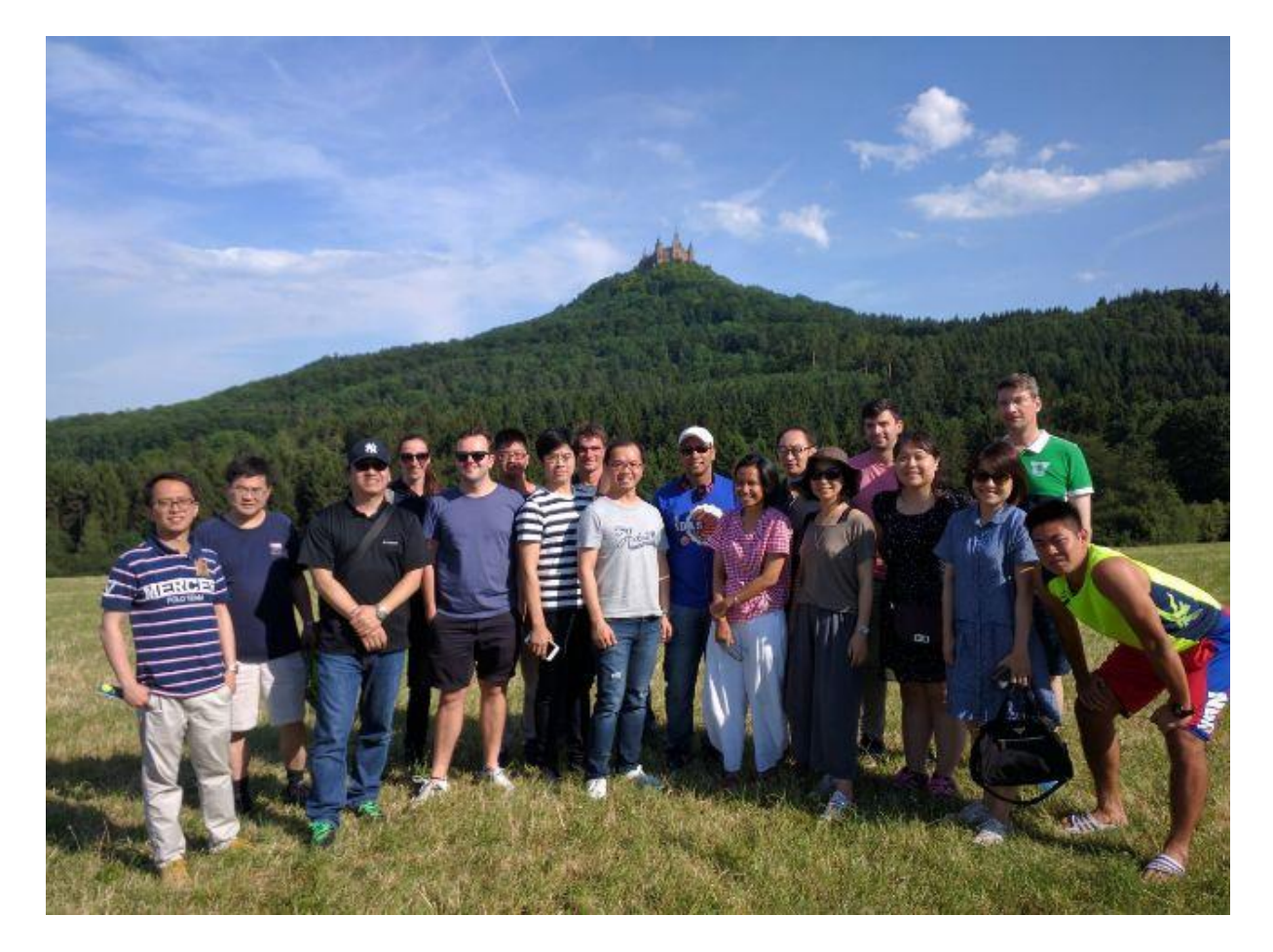
No. 9, December 2017