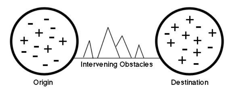
Figure 2. Origin and Destination Factors and Intervening Obstacles in Migration Source: From 'A Theory of Migration' by Lee, 1966, Demography , 3 (1), p. 47-57.

Flows take place between two places, but there are intervening obstacles to these spatial movements (See Figure 2). There are many factors both in the places of origin and destinations, we could group the factors into two main categories: environmental factors, and economic and social factors. With environmental factors, we mainly discuss the climate, attitude, land resources, water resources, and location. For economic and social situations, we can compare the situations of living standard, income, employment situation, education facilities, medical services, and transportation. For intervening obstacles, we could discuss the distance and the great changing of the migrants' life, the change of lifestyle, change of productive activities, language obstacles, and loss of traditional living skills. For personal factors, we mainly focus on the migrant's age, sex, education, occupation, and income, the number of livestock, and area of grassland.