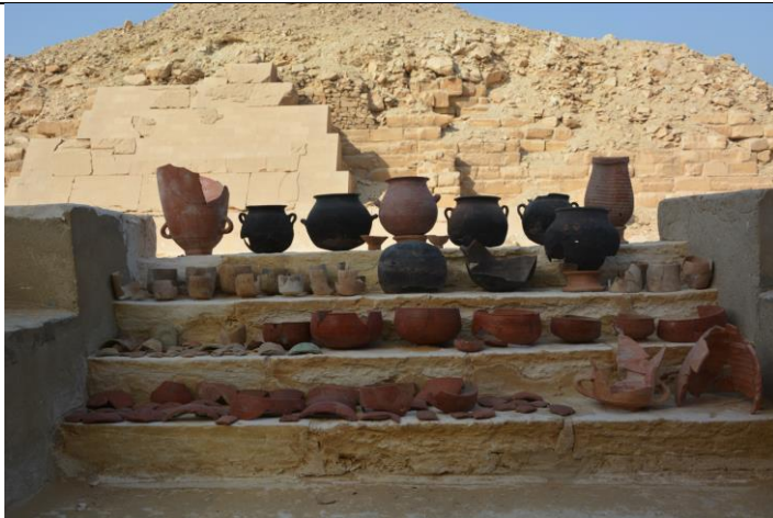
Fig. 3: Vessels from the em- balming workshop