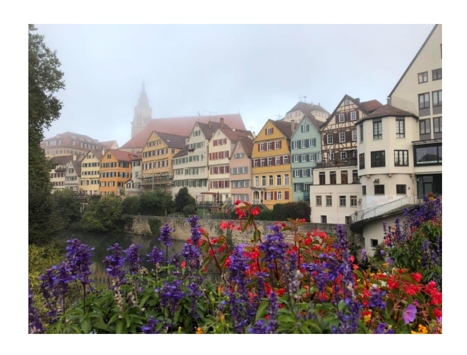
Tübingen, 4-6 October 2023

European Research Center on Contemporary Taiwan University of Tübingen