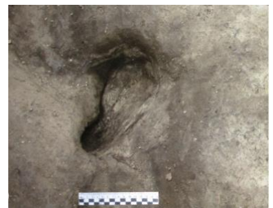
Potential hominin footprint discovered in Schöningen 13 II-2 Untere Berme.