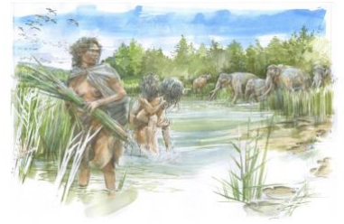
This is how it might have looked in Schöningen about 300,000 years ago. Watercolor by Benoît Clarys.