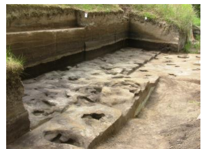
Fossil footprints from the site Schöningen 13 II-2 Untere Berme.