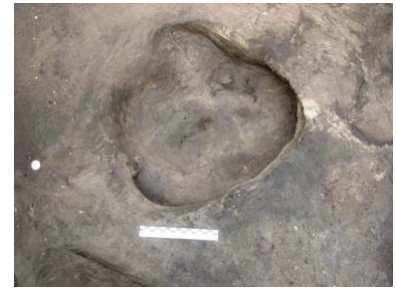
The footprint of a rhinoceros - Stephanorhinus kirchbergensis or Stephanorhinus hemitoechus - is the first of this species from the Pleistocene found in Europe.

The Senckenberg Gesellschaft für Naturforschung (Senckenberg Nature Society) , a member institution of the Leibniz Association, has studied the “Earth System” on a global scale for over 200 years – in the past, in the present, and with predictions for the future. We conduct integrative “geobiodiversity research” with the goal of understanding nature with its infinite diversity, so we can preserve it for future generations and use it in a sustainable fashion. In addition, Senckenberg presents its research results in a variety of ways, first and foremost in its three natural history museums in Frankfurt, Görlitz, and Dresden. The Senckenberg natural history museums are places of learning and wonder and serve as open platforms for a democratic dialogue – inclusive, participative, and international. For additional information, visit www.senckenberg.de .