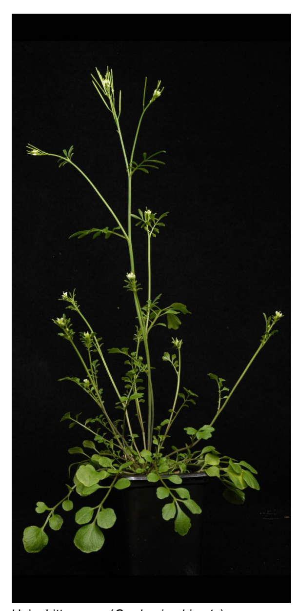
Hairy bittercress ( Cardamine hirsuta ).