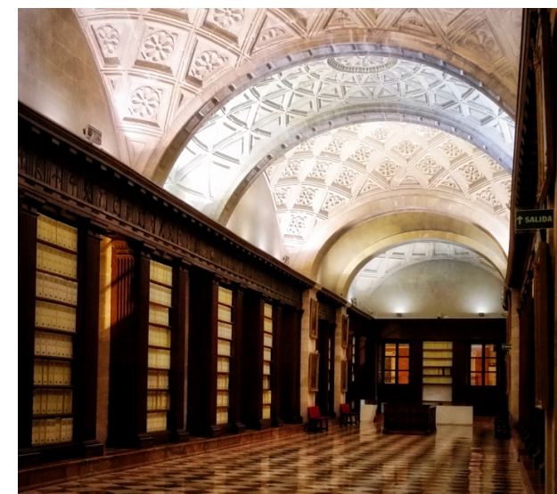
CRC 923 „THREATENED ORDERS. SOCIETIES UNDER STRESS“