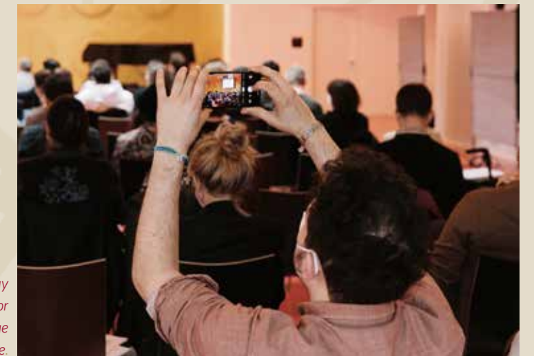
Since 2013, the LEAD Day of Science offers a platform for knowledge transfer and the exchange between research and practice.

The online lecture series LErnforschung Auf Distanz reached several hundred people in winter 2020/21 and along with the annual LEAD Day of Science which took place in spring 2022 with 200 participants made a major contribution to the profile of LEAD and the schools cooperation program. It also boosted the LEAD.schule.News newsletter, which had 40 subscribers at the start of 2017 and which today reaches more than 900 people in educational practice, policy and research.