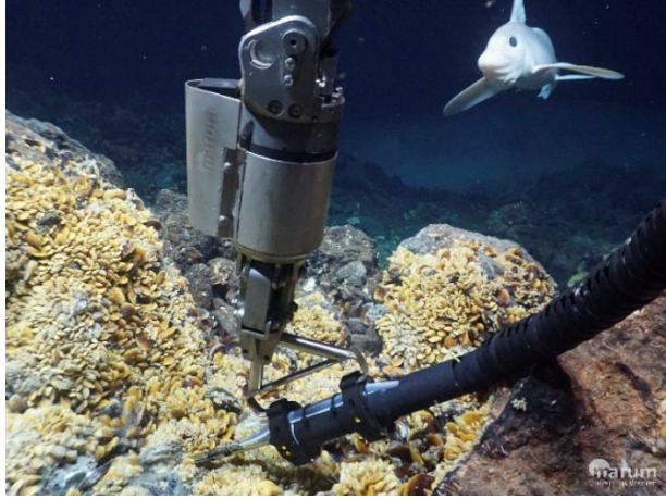
In the field studies on black smokers, robots are used to depths as great as 3000 meters; they are equipped with extensive sensor technology and can take samples of the fluids and rocks.