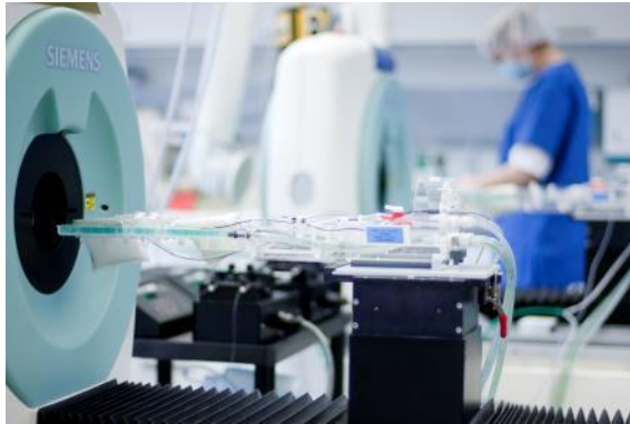
Using a PET device, the marked cells become visible on the screen.