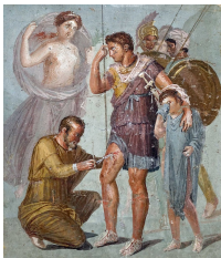
Pompeian depicting a wounded Aeneas and his mother Venus carrying a few sprigs of the Cretan plant dictamnus . National Archaeological Museum of Naples