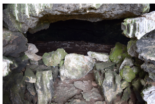
Biniadrís cave, Menorca

11:00 – 11:30 Monica Barget (Maastricht) Goods, people, ideas – island exchanges in early modern Europe