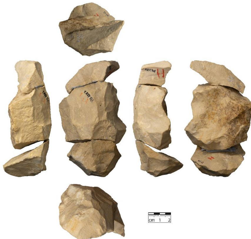
Middle Paleolithic stone core from the Heidenschmiede. By re-assembling these stone artefacts, the research team revealed the many different techniques used in stone tool manufacturing.