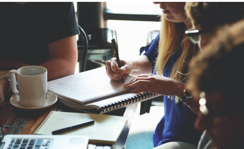
Joint study courses

The term » Educational Governance « is relatively new in the German-speaking countries, but well-established in an international, especially English-speaking discourse. Despite commonalities, there are different meanings and aims attached to it and the term itself is contested: International organizations use Educational Governance as a strategic concept to ensure effective regulation and »modernization«, especially with regard to countries of the Global South; national governments adopt the term to gain access to international debates and legitimize action, and also the Social Sciences have jumped into the debate: they discuss whether Educational Governance is a mere buzzword or a useful academic concept.