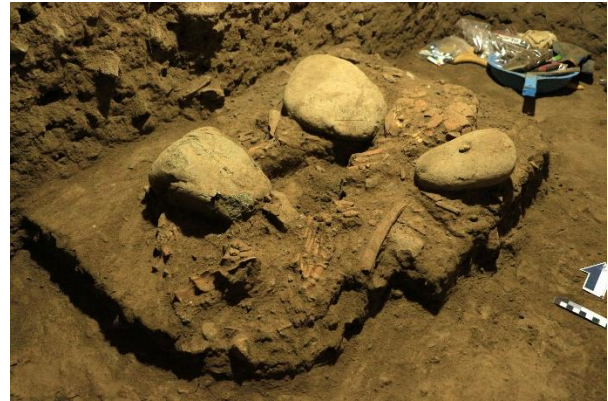
Excavations at the Leang Panninge site: Skull fragments between the stones which were laid over the burial (left). The skeleton as found (right).