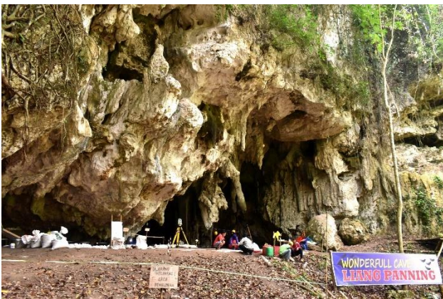
The Leang Panninge cave on the southern peninsula of Sulawesi, Indonesia.