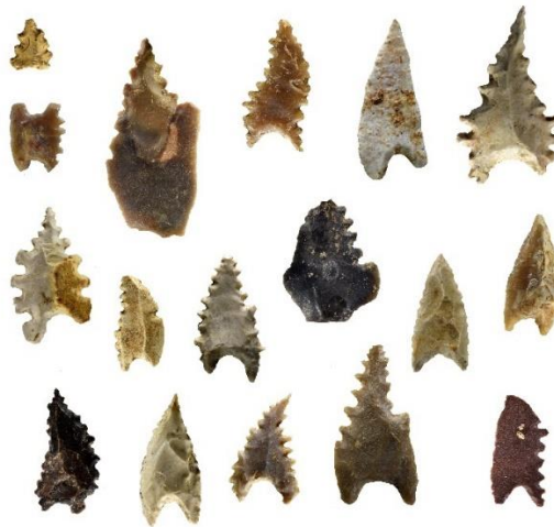
Stone arrowheads, known as Maros points, are up to 8,000 years old. They are considered typical of the Toalean techno-complex developed by the people living in the south of the island of Sulawesi.