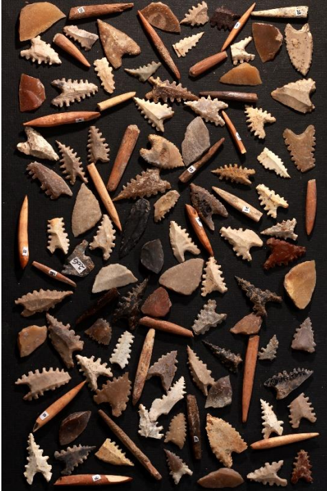
Toalean arrowheads and tools made of bone and stone.