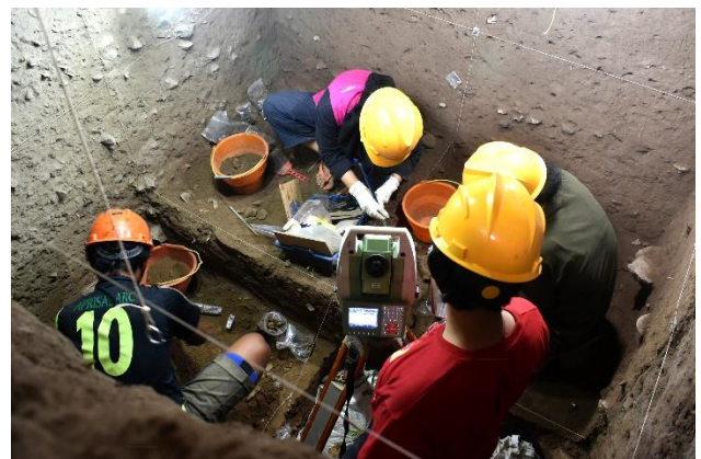
Excavation work at the Leang Panninge site.