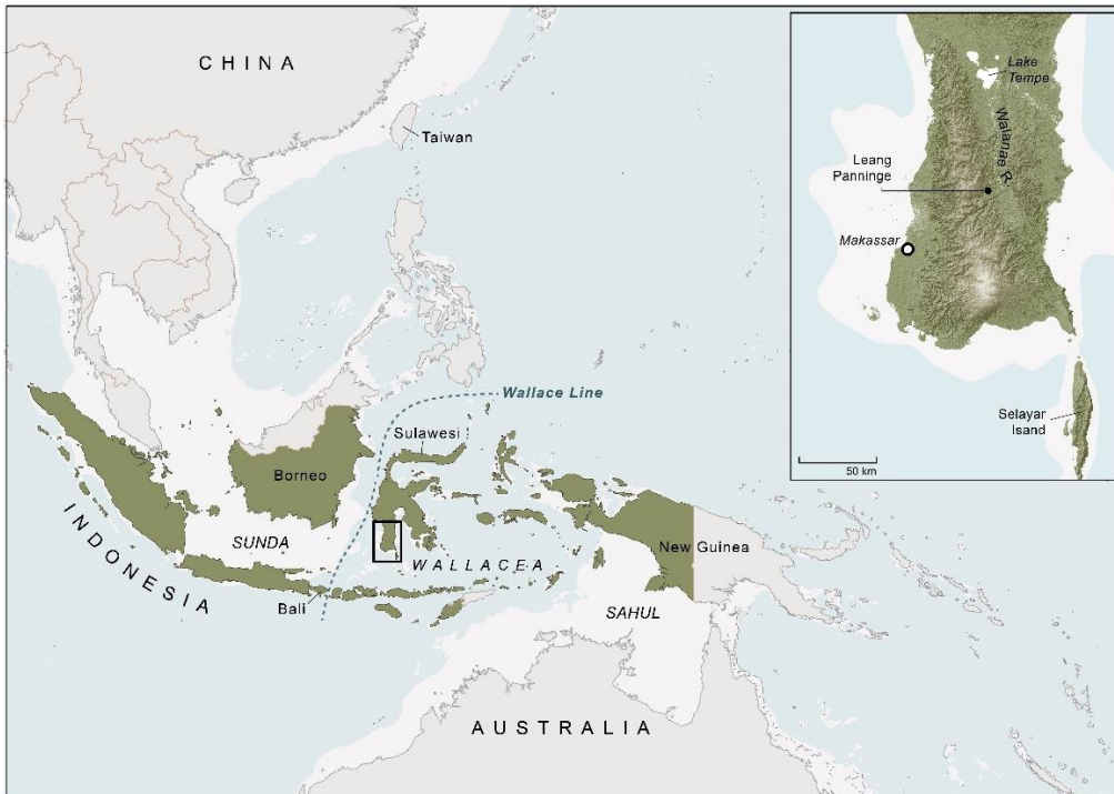
The map of southeast Asia shows the Wallacea area and the island of Sulawesi. Inset: the southern part of Sulawesi where the Leang Panninge cave is located. Image: Kim Newman