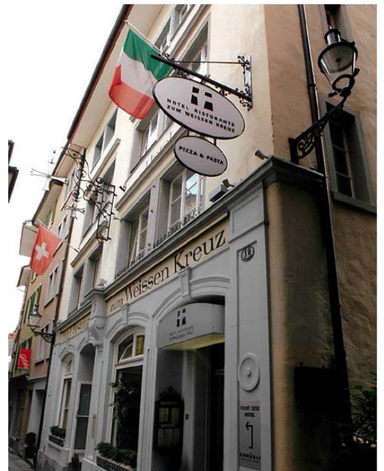
The 'Hotel zum Weissen Kreuz' in Luzern, where Neesima stayed on 8 th August 1884, still exists today. Two weeks afterwards the encounter with Hermann Hesse happened