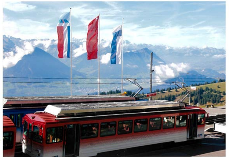
The funicular to Rigi Kulm and the panorama seen from the mountain region