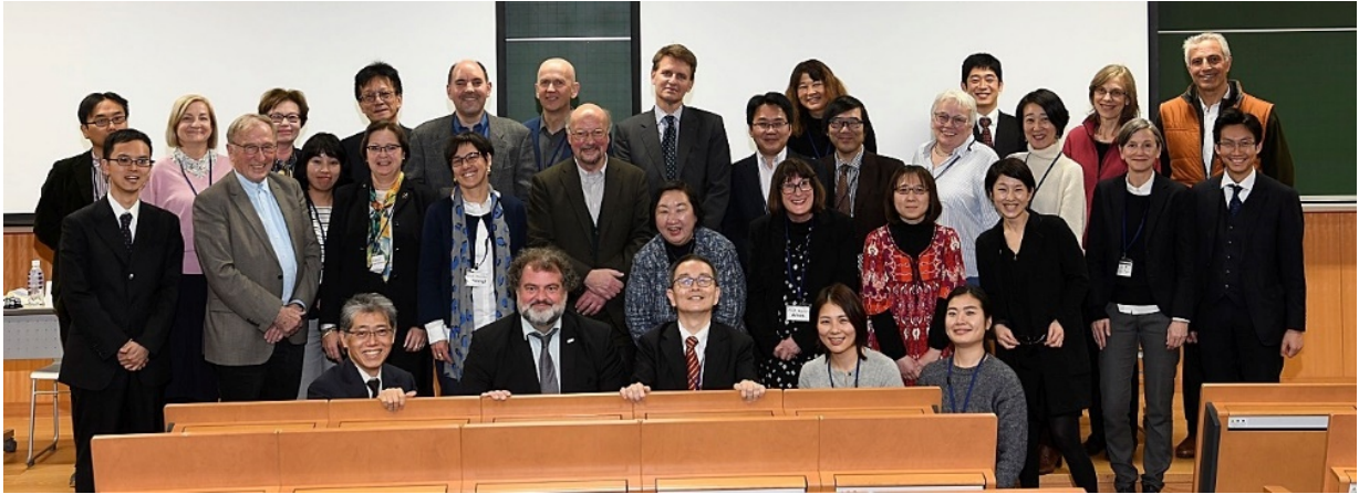
After the Panel Sessions at Ryōshinkan