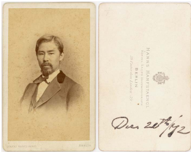
Photo portrait of Neesima taken in Germany in 1872