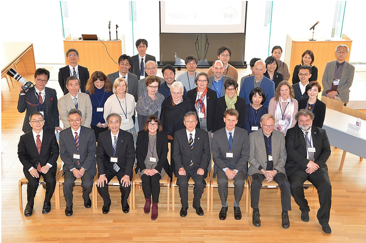
First day at Kotobakan Chapel, Kyōtanabe Campus

Under the general theme of ‘Challenges toward Building Societies Filled with Respect for “Diversity”’, panel sessions with presentations on the following sub-themes were prepared: Diversity of physically and/or mentally challenged persons; Biodiversity; Diversity of gender/sexual orientations; Diversity of personal backgrounds and religions; Diversity of speech and thoughts. A lively discussion on those different subjects in English language followed between the scholars and researchers from Dōshisha University and the University of Tübingen.