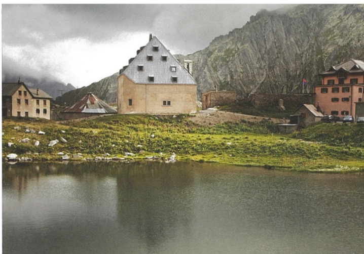
The hotel on St. Gotthard Pass, where Neesima is said to have written his testament

The first anecdote plays around the encounter of the founder of Dōshisha University with Hermann Hesse. On 5 th August 1884, Jo Neesima on his second voyage to Europe entered Switzerland coming from Italy. On the following day he collapsed from a heart attack and almost died in St. Gotthard Pass. Therefore he wrote his testament. Two days after the collapse and after he had recovered a little, Neesima moved down from the Pass and continued his journey by train and ship to Luzern in Central Switzerland.