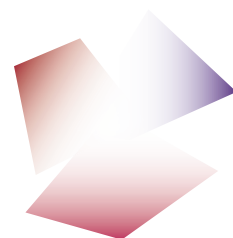
The 3rd TUDOKU Conference

1. Researcher, Institute of Historical Studies (in Seoul) / 2. The modern history of Korea, the independence movement of Korea, movements of the national united front in the colony Korea, nationalism, communism / 3. 'Singanhoeui changlipkwajung yeongu (The Korean Communist Party Transforming Singanhoe from a Nationalist Association in the National Mass Party of Korea), Mijokmunhwayeongu , 75, 2017.5