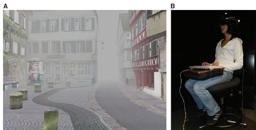
FIGURE 1 | Setup. (A) A snapshot from Virtual Tübingen with fog hiding adjacent intersections. (B) A participant equipped with a HMD and a keyboard is typing in a route sequence.

In every trial, participants faced a start location, looked around, and confirmed recognition of location and orientation by pressing space. The written name of the target location (e.g., a tavern, train station, fire hall) appeared on the HMD-screen. To enter the route sequences leading to target locations, participants turned to face the initial direction of their chosen route, pressed the “up/forward” arrow key on the keyboard, entered the remaining sequence, and finished by pressing “space.” A sequence might look the following: “forward, left, right, forward, left.” Participants were explicitly told to report all navigation decisions (i.e., to include decisions to remain on the direction) at all intersections along the route, but to ignore gateways and dead-ends. Participants always remained at the starting location and were not moved through Virtual Tübingen, i.e., they faced the same scene as if they were standing at that start location during the whole recall procedure. Participants controlled inter-trial intervals themselves, and did not receive any feedback. They had successfully identified start and target locations on snapshots dis-