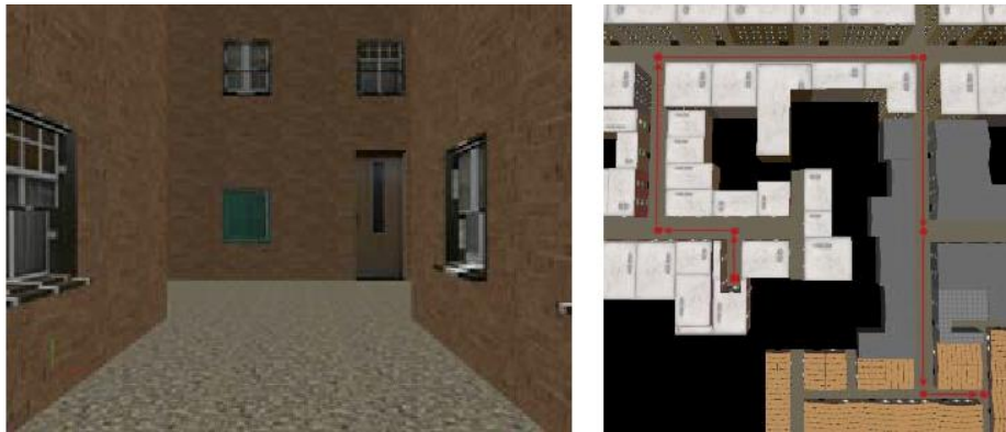
Fig. 1. The virtual city as seen from navigation perspective (left side) and from bird's eye view with the route marked in red (right side). During learning the start, the end and each of the six intersections in-between were marked with white crosses on the floor (marked by red dots in this figure). They served as locations to be teleported to and as targets during the test phase.

24 participants took part in the experiment. One participant's performance did not significantly differ from chance and was not included, leading to 23 participants (11 females and 12 males) aged between 21 and 64 ( M = 29.6 years, SD = 9.3 years) used in the analysis. All participants were recruited via a subject-database, gave written informed consent, and were paid for their participation. The procedure was approved by the ethical committee of the University Clinics Tübingen.