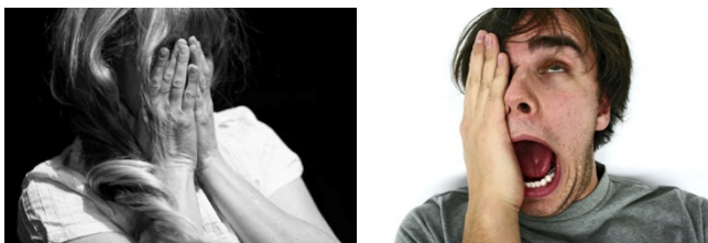
Fig. 2: Desperate laymen after failing to improve their lives by applying recent scientific findings.

Moreover, such a policy would also allow to avert the dramatic effects of publishing this "knowledge" on the general public. Recently, many researchers and journals aim to make their findings available not only to the scientific community but also to the generable public. Consequently, layman try to apply this knowledge in order to improve various aspects of their lives. However, as this ostensible "knowledge" is simply crap, these attempts fail and if anything, worsen the lives of these people. Figure 2 provides an illustration of desperate laymen after having tried to apply recent "scientific" findings to their lives. 1 Hence, preventing researchers from publishing their manuscripts might save the happiness and lives of many innocent people.