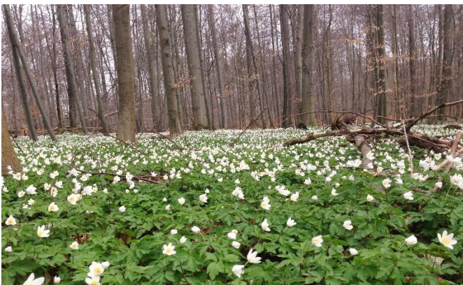
Study sites in April 2017 Top: Beech forest near Hainich-Dün

“What is particularly interesting, however, is that the differences in flowering times we identified cannot be explained by temperature alone,” says Willems. The planting of new tree species such as spruce – as well as the altered structure in managed forests – lead to new environmental conditions. For example, light availability or soil properties may change, and these factors could also influence when plants come into bloom.