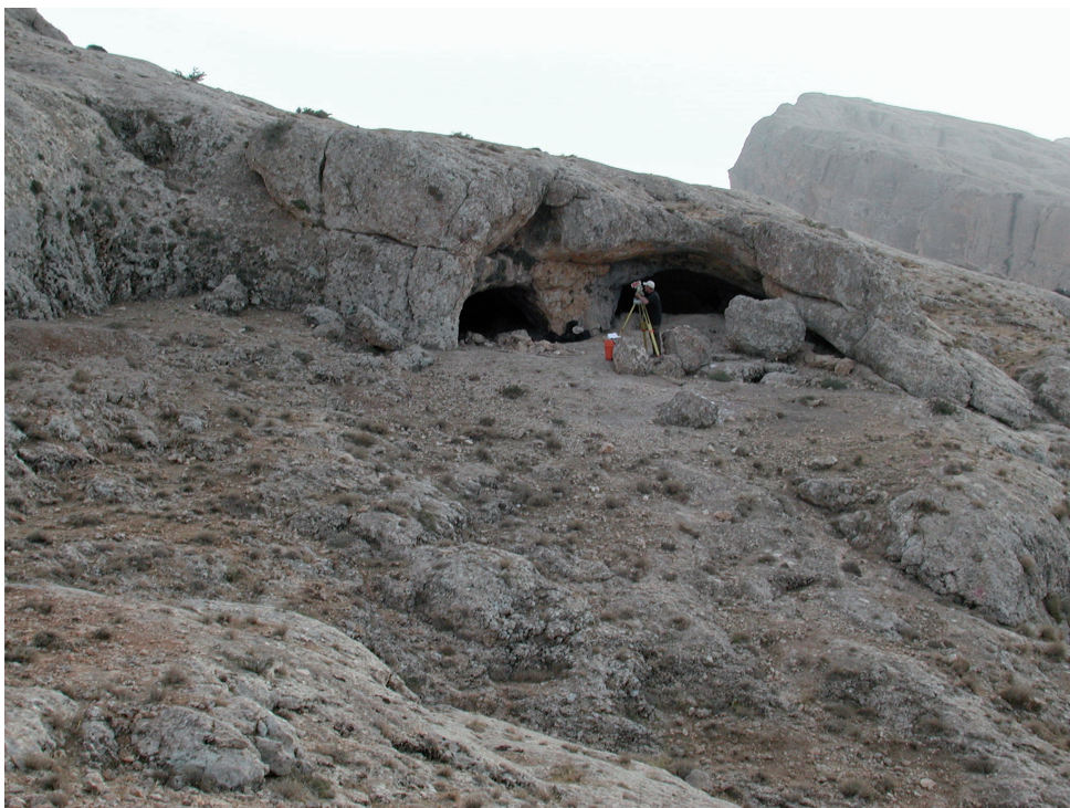
Photo 1. Kaus Kozah Cave. View looking south with limestone cliffline of Ma'aloula in background (25 October 2004).

The excavation at Kaus Kozah Cave is part of the Tübinger Damaskus Ausgrabungs- und Survey Projekt (TDASP). The project began in 1999, and the members of the project have succeeded in locating 319 archaeological localities (Chapter 16, this volume). Parallel to the survey, the team conducted excavations at Baaz Rockshelter near Jaba'deen in 1999, 2000 and 2004 (Conard 2002 & Chapter 6, this volume). In the fall of 2004 the TDASP team directed its attention toward the excavation of Kaus Kozah Cave on the back side of the Oligocene limestone cuesta near Ma'aloula (Fig. 1 & Photo 1).