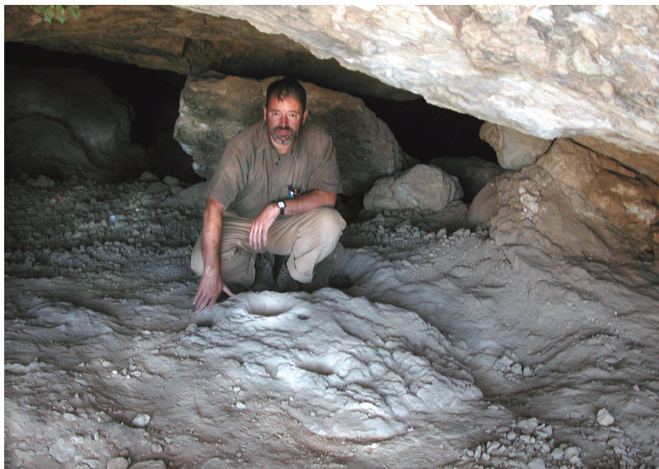
Photo 2. Kaus Kozah Cave. Bedrock mortars in west entrance (25 October 2004).