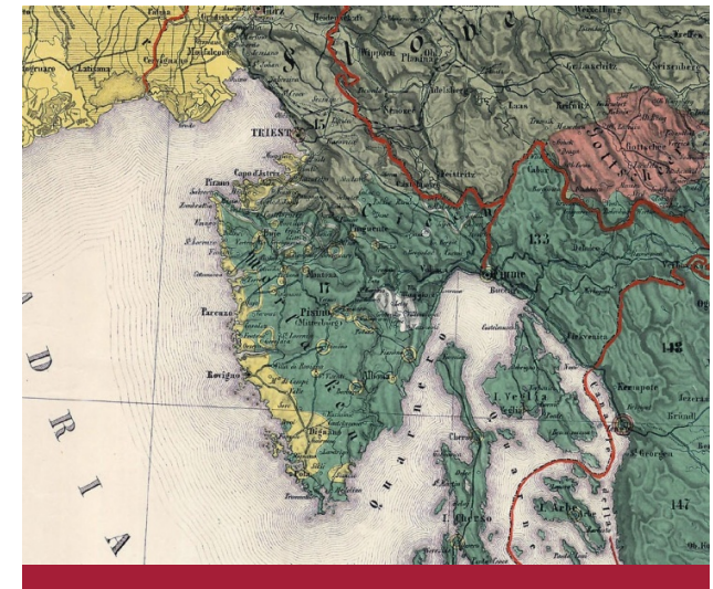
SFB 923 – THREATENED ORDER. SOCIETIES UNDER STRESS