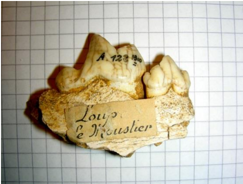
Fragment of jaw of a wolf from Le Moustier that was analyzed during the investigation.

and exploited more diverse food resources than previously thought, makes the biological differences between these two types of prehistoric humans always smaller. In this context, the exact circumstances of the extinction of Neanderthals by modern humans remain unclear and they are probably more complex than just a behavioral superiority of one type of humans compared to the other.