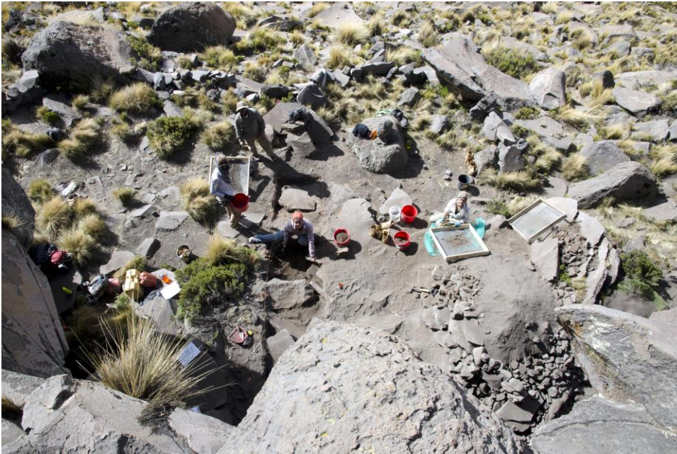
University of Tübingen excavation team in the Cuncaicha rockshelter of Peru.