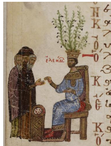
Personification of Charity distributing money. Illustrating Psalm 36:26. Theodore Psalter, 1066. (British Library, MS. Add.19352, fol. 43v).