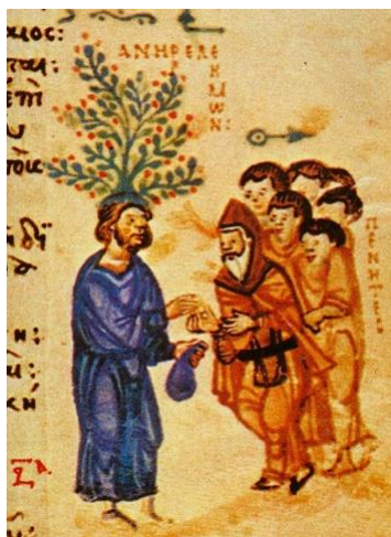
Personification of Charity distributing money. Illustrating Psalm 111:9. Chludov Psalter, 9c. (Moscow, State Historical Museum, MS. gr. 129, fol. 116r).

By reading the figurative language of the Psalms with an iconographic lens, we can begin to extrapolate meaning for the expression of personifications in the Middle Ages. The figure of Charity in the Psalms, bearing fruited branches that billow upwards and with a hand extending outward to the characterized poor, enacts this necessary social function as a living root.